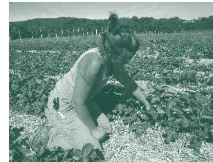
Cedar Circle Farm

We welcome you to split a share with friends or neighbors and recommend that you alternate pick-up weeks rather than try to split the contents of each week's share.